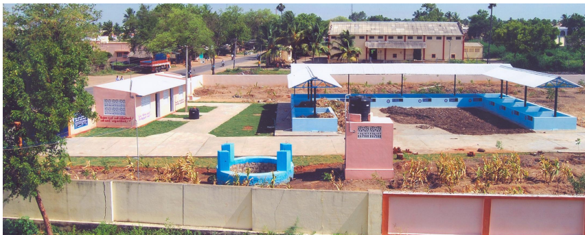
Compost Park Paramathi Town Panchayat (Namakkal District)