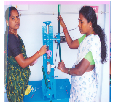
Plastic Recycling Unit Thottiyam Town Panchayat (Trichy District)